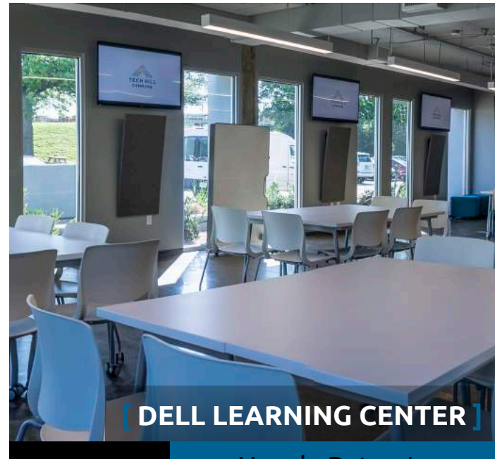
[ DELL LEARNING CENTER ]