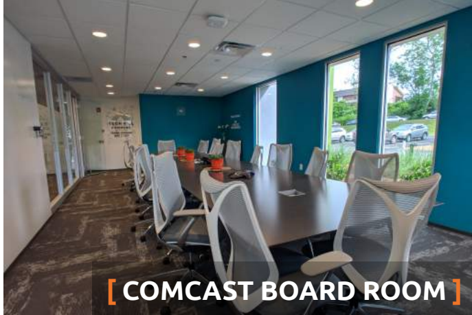
[ COMCAST BOARD ROOM ]