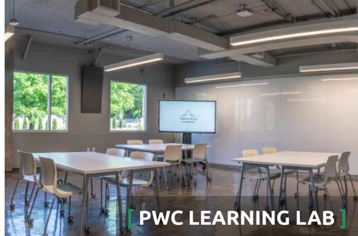
[ PWC LEARNING LAB ]