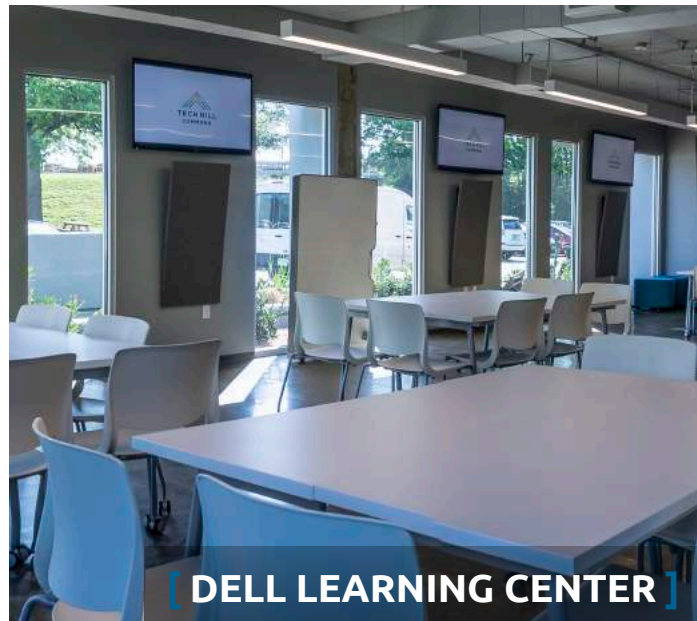
[ DELL LEARNING CENTER ]