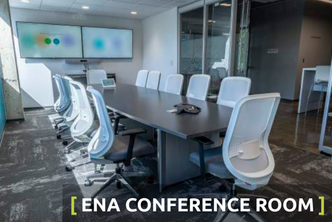
[ ENA CONFERENCE ROOM ]